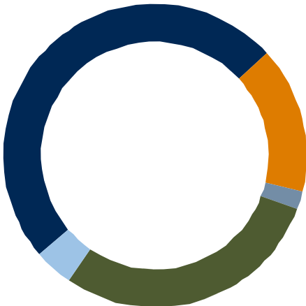
REVENUE BY TYPE Excluding In-Kind